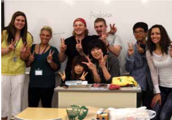
TOP: Five WSC students pose with three Japanese students with whom they spent time with during their trip.