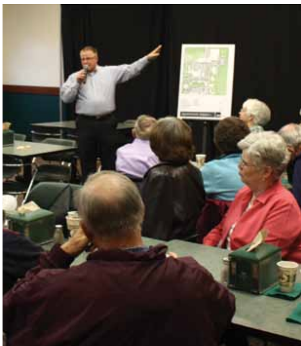
RIGHT BOTTOM: Breakfast in the Teton Grill.